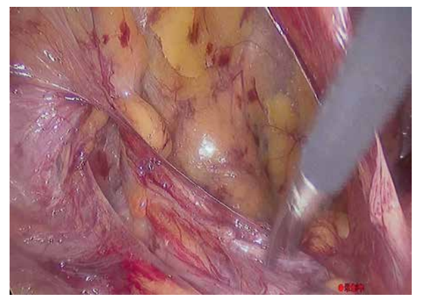
Photo 5. The separation of the spermatic cord mainly relies on opened scissors to peel off loose connective tissue

the vas deferens (Photo 5). The death coronal was separated with closed scissors. Venous bleeding was compressed through pad, arterial bleeding was stopped through suturing or clipping. The peritoneum was continuously sutured with 1-0 absorbable thread afterwards (Video, 2).