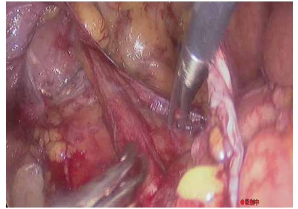
Photo 4. The scissors are slightly opened to separate the danger triangle and the pain triangle. The peritoneum was separated by slowly peeling along the surface of the TF with scissors