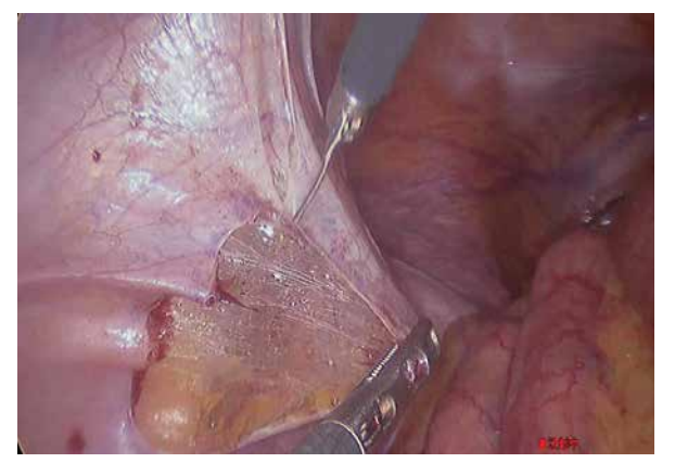
Photo 1. Certain tension of the tissue was maintained with the left hand to reduce the possibility of bleeding

the hernia sac and the spermatic cord, scissors were cut open to separate the tight connection in the preperitoneal space (Photo 3). The scissors disconnected from the middle of the large hernia sac when it was relatively large. The peritoneum was also separated from the preperitoneal space mainly relying on slightly opened scissors. The scissors were gently and slowly peeled off along the preperitoneal plane. The peritoneum and spermatic cord were completely peeled off with 2–3 times (Photo 4). When separating the dangerous triangle and the pain triangle, scissors were also used to peel off the peritoneal tissue with sharp and blunt dissection. At the vas deferens level, the scissors were slightly opened and gently moved to prevent the damage to